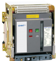
NH1 series isolating sw... Disconnectors, Isolators